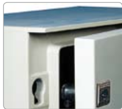
Built-in canopy protecting the door and the sealing gasket. Two double-bar 3-mm locks outside the sealed zone.