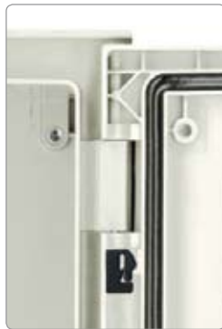
Polyamide hinge pin, easily removable and captive.